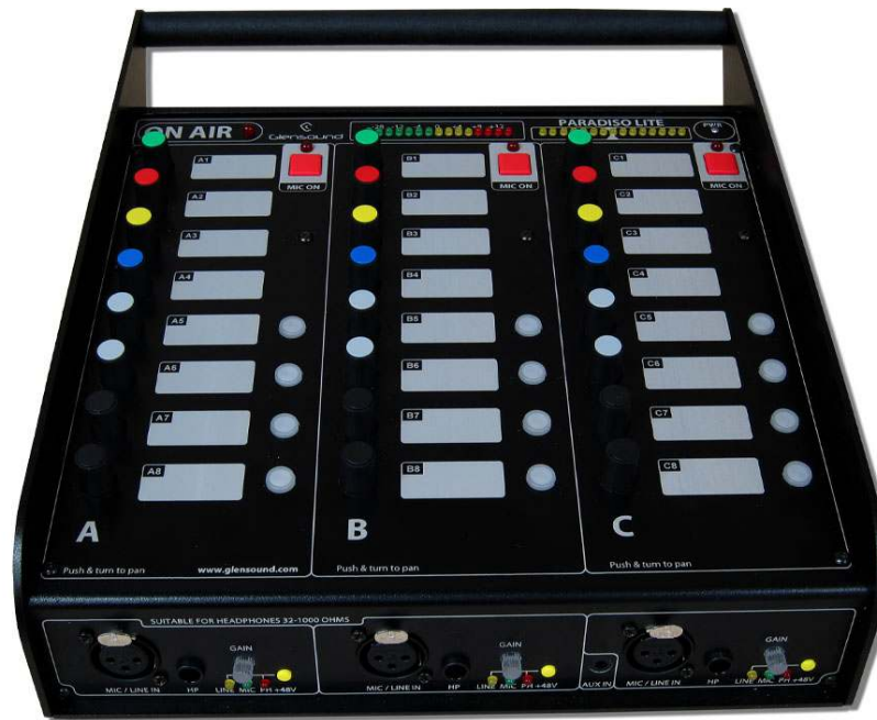
Paradiso LITE Commentators Box